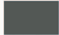
Medium Gray 0122